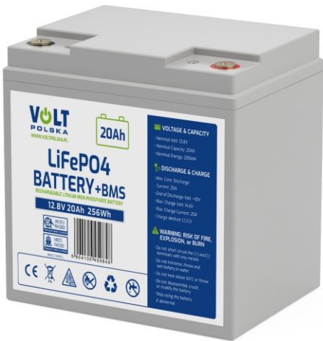
LifePO4 battery 12,8V 20Ah