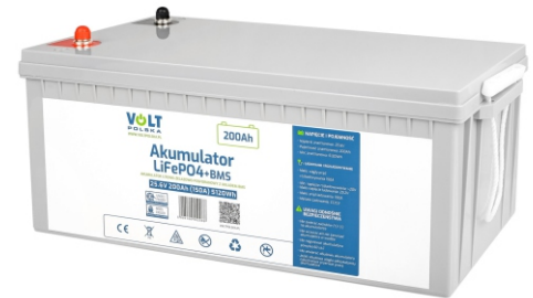
LifePO4 battery 25,6V 200Ah (200A)