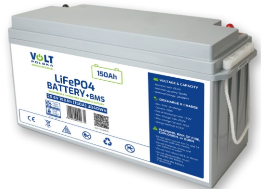
LifePO4 battery 25,6V 150Ah (150A)