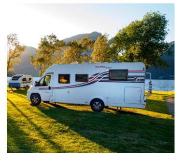
Use in motorhome