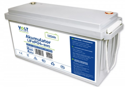
LifePO4 battery 25,6V 120Ah (120A)