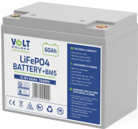
LifePO4 battery 12,8V 60Ah (60A)