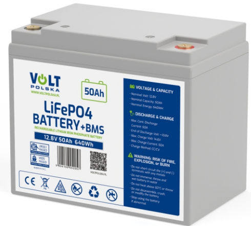
LifePO4 battery 12,8V 50Ah (50A)