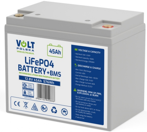
LifePO4 battery 12,8V 45Ah (40A)