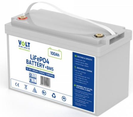
LifePO4 battery 12,8V 100Ah (150A)