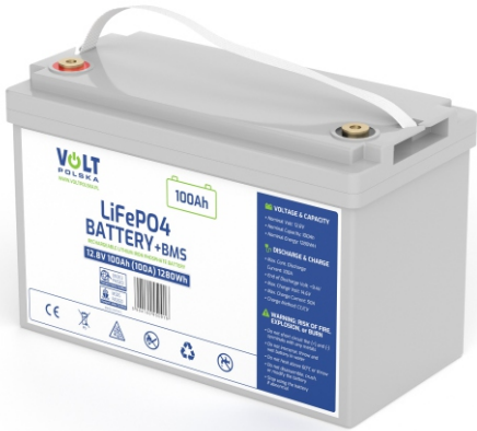
LifePO4 battery 12,8V 100Ah (100A)