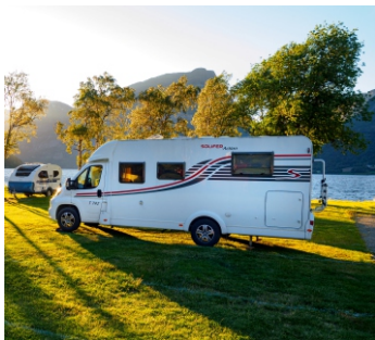
Use in motorhome