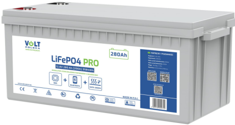
LifePO4 battery 12,8V 280Ah (200A)