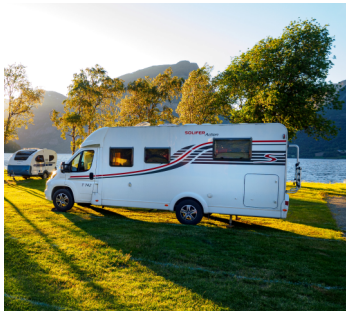
Use in motorhome