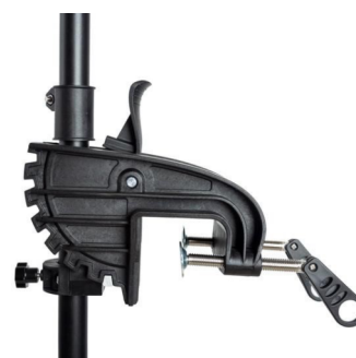
Battery voltage display