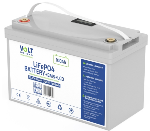
LifePO4 battery 12,8V 100Ah (100A) + LCD