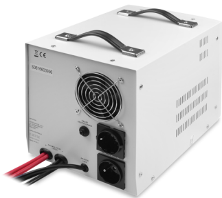
SinusPRO E 2000 12V