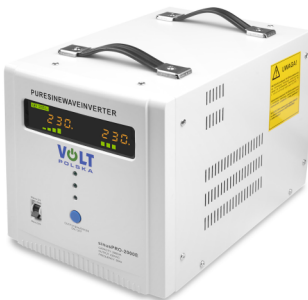
SinusPRO E 2000 12V