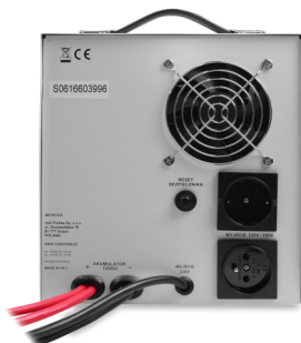
SinusPRO E 2000 12V