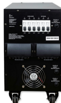
AVR PRO 15000VA 3% 3F