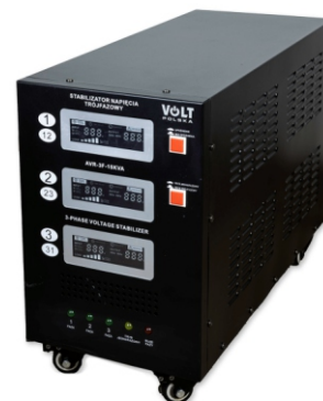
AVR PRO 15000VA 3% 3F