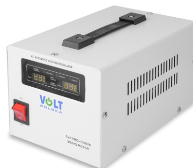
AVR PRO 1000VA 3%