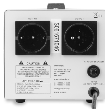
AVR PRO 1000VA 3%